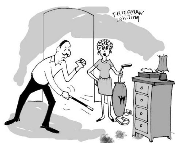
"Too bad dust bunnies don't vanish like magic rabbits."