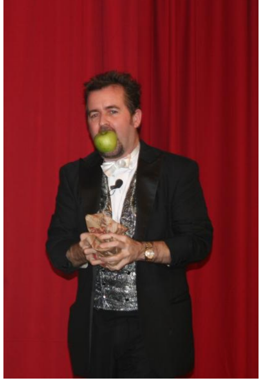
The Magical Misfits!