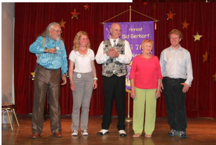
2012 Stage Competition Contestants