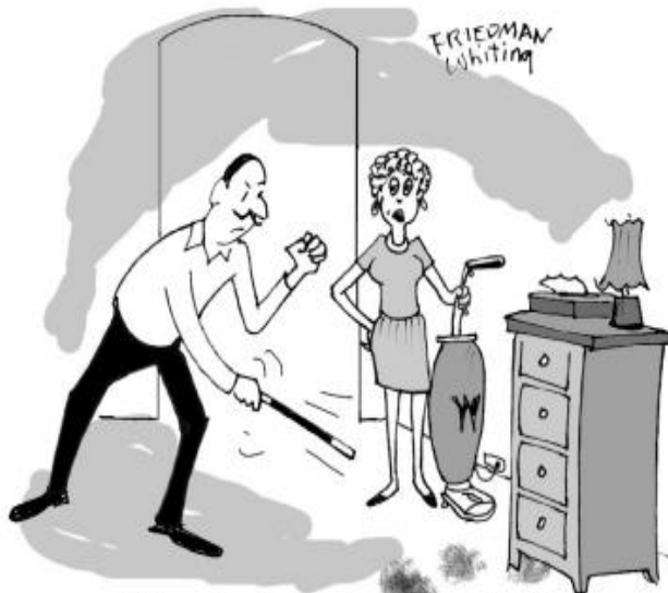
"Too bad dust bunnies don't vanish like magic rabbits."

J B Y I E S U A M P X S G I R D J C R X H H R C Q L F O I L P S C Y I V M K P N F F O B O C X D Z H N V E V X Z Z Z U O G U O Y R Z G W V C E H L O S P P Y K M N R Y L A I R Q R C K J G D J T S F Y O F S J O Q E J J B Z W L S C K X W X J D F T V V C I L C Q L X V S B N I I C V F L A S G I H N U Z A N S L H V Z B S D S I L F D B K N A H T E D U I O S I O O R T N V O T R N W C P D G U N E E P L G A Q A B E B X N G S B K W C C X T S U M F L K B C B C V D B C K P H C Z R T E B U O R P H N Z U U V C Q W V V R P O R O P E C U T G S K Z S V