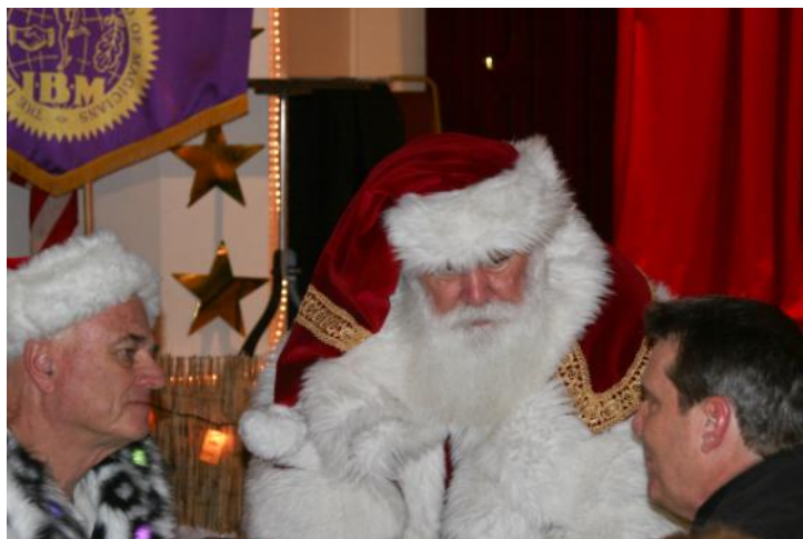
Who's been naughty and who's been nice?

As you know, we always have a pot luck for the food and provide first class entertainment for the members and their guests. The entertainment will be announced