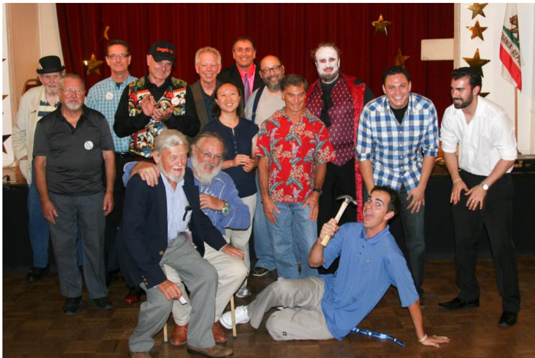
Our Cast for Spooky October