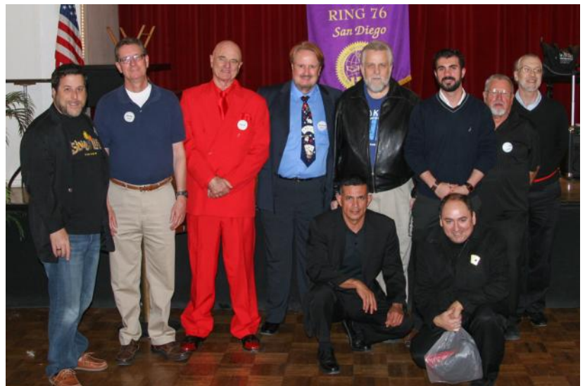
Anything But Cardicians