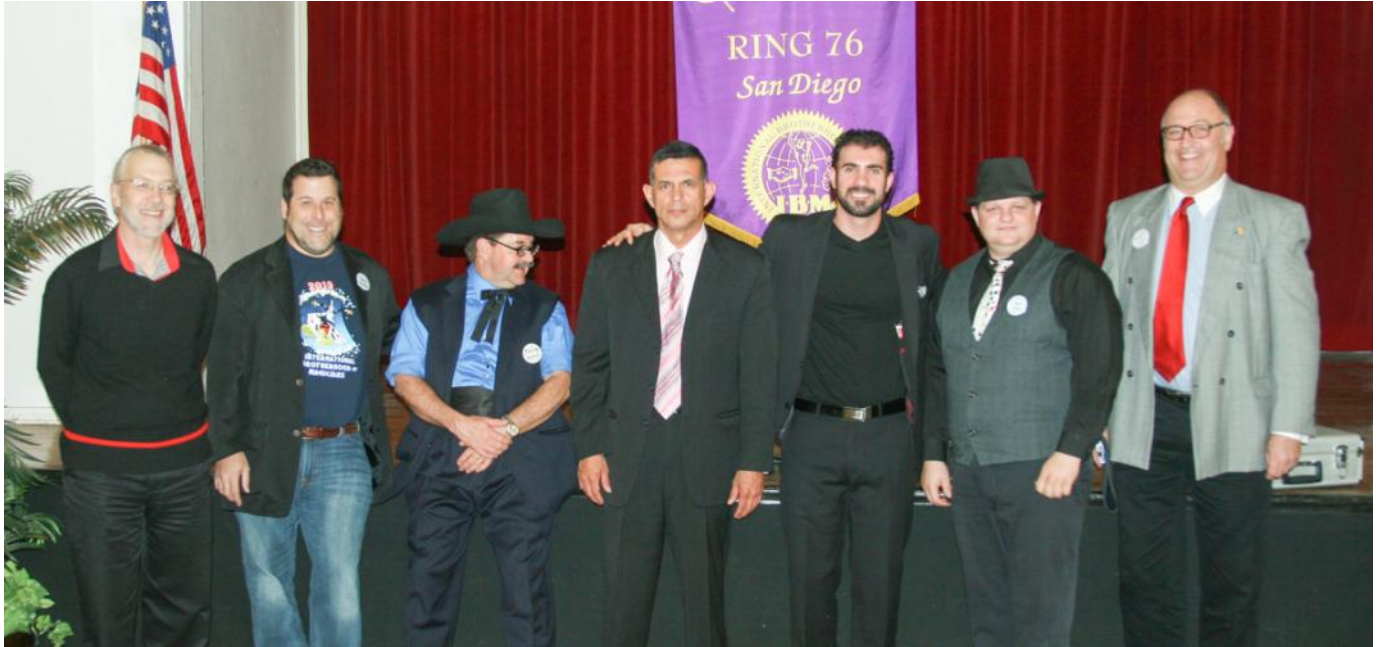
2014 Ring-76 Close-Up Contest Contestants