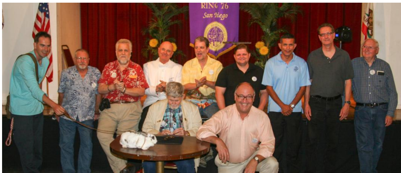
The Money Mob