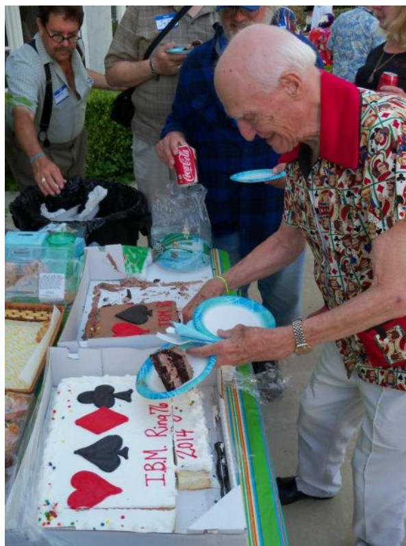
Let Them Eat Cake!