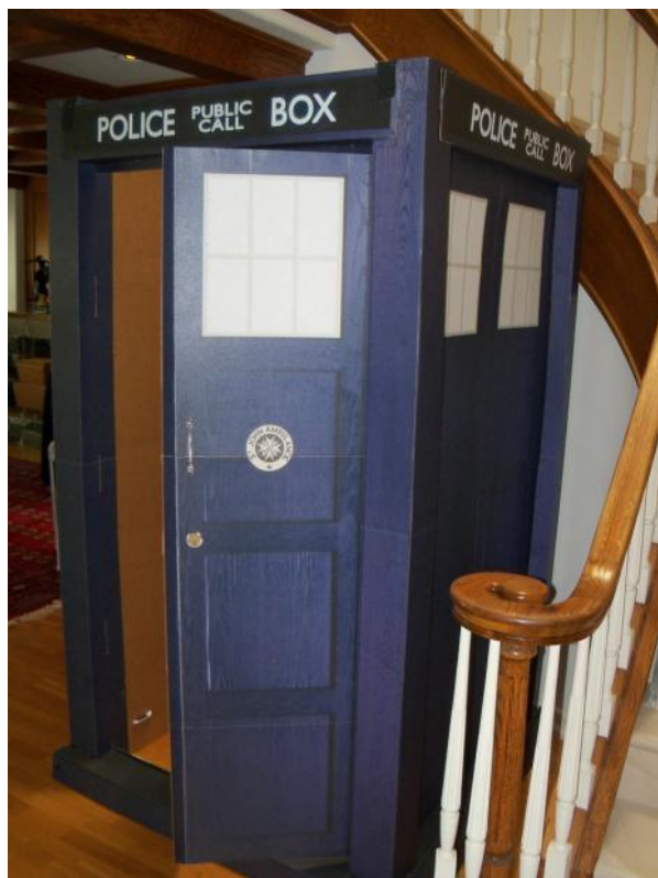
It's bigger on the inside.