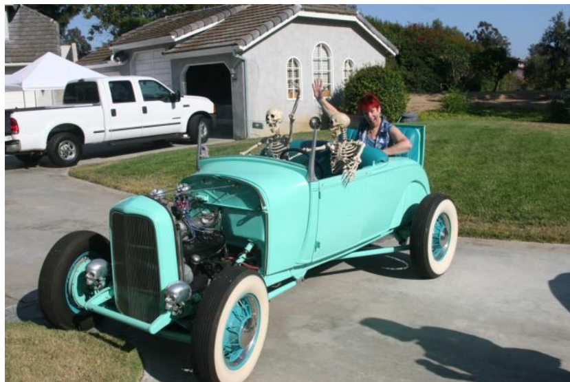
Arriving in Style