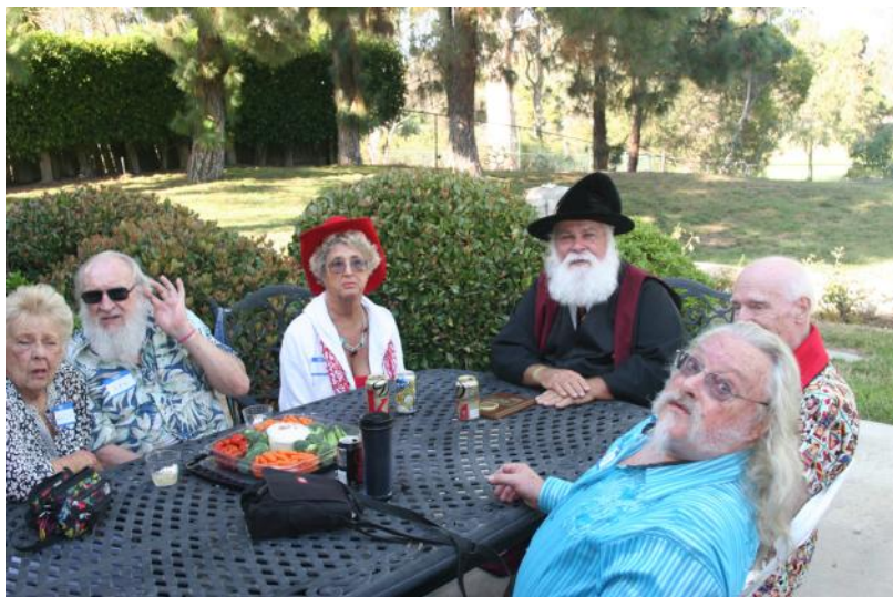
Socializing in the back yard