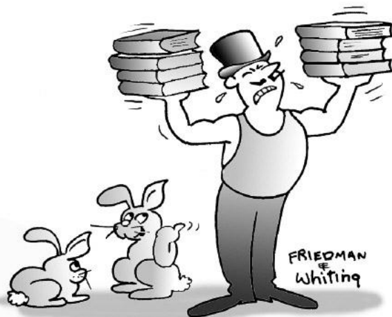
"He stays fit by lifting Tarbells every day."

increased (daily) practice and rehearsal (they are different), and focusing more on being an entertainer rather than a perfect technician only. The increased confidence and enjoyment you get out of performing, once you get relaxed and comfortable performing for your peers, is huge!