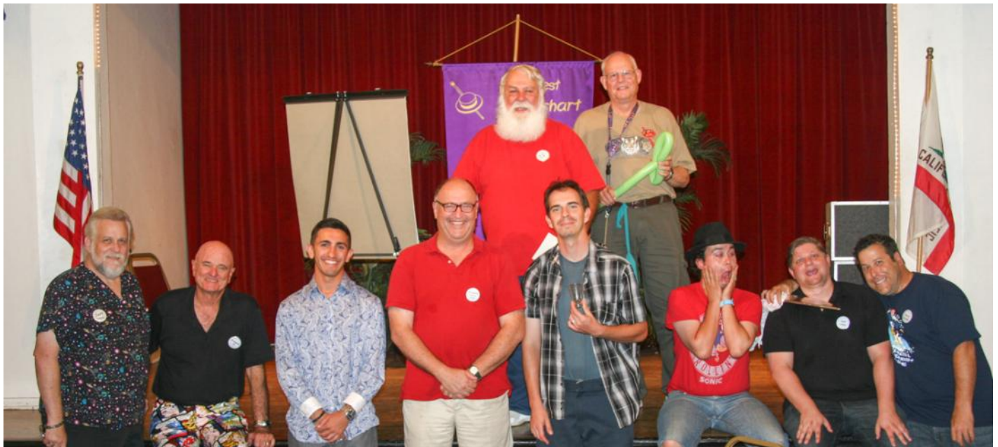
Performers for the Month of August

Also Tuesday, Sept. 16 is the strolling magic show down in the inner circle. Signups are at 7pm and the strolling magic is at 8pm. In order to compete in the strolling magic show down you must be a magician member of the AMA.