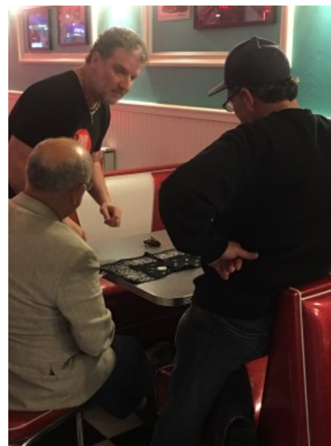
Magic Sharing at After Glo