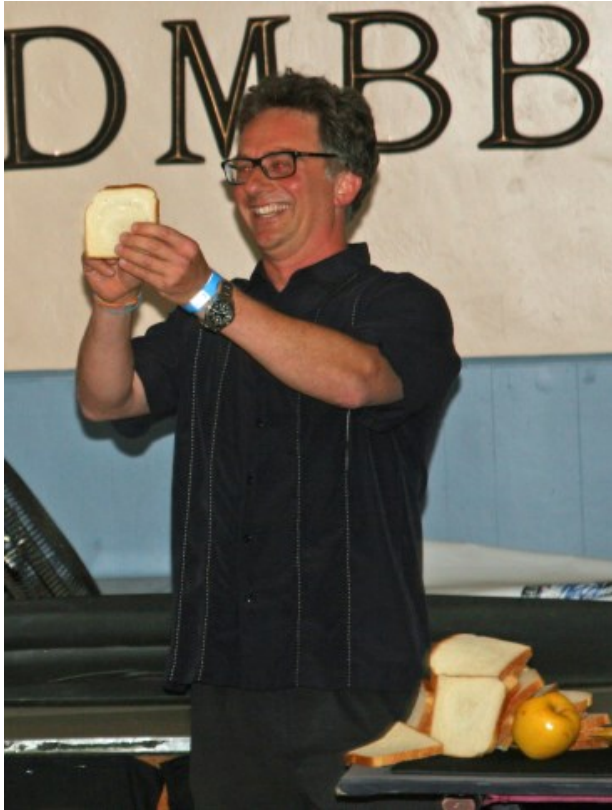
With his Sliced Bread Deck