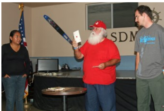
Joe Mystic’s “Spelling” card location process works for Lupe but not for Kenny