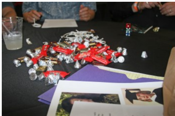
Ken Intriligator produces a sweet surprise