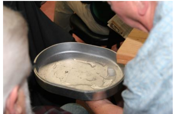
Bruce shows ice melting on cold pan but not on warm board.