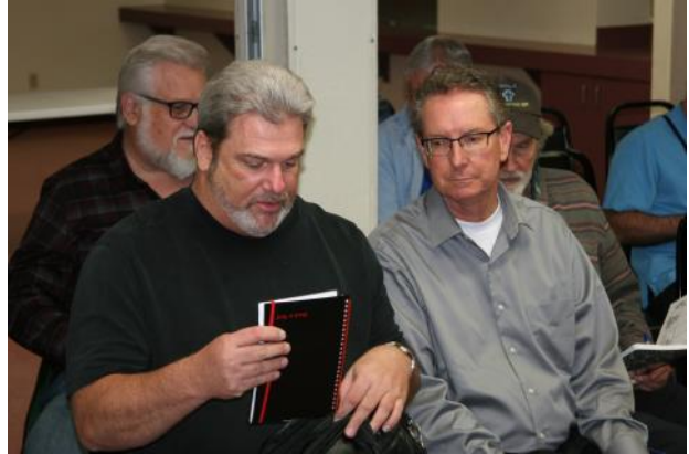
Judges and Arbitrator in place.