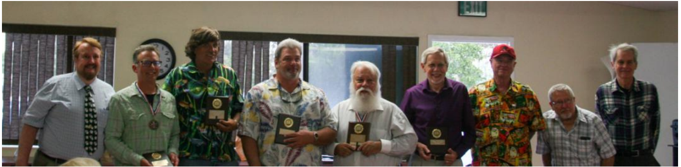
Outgoing Board of Officers (2018-19)