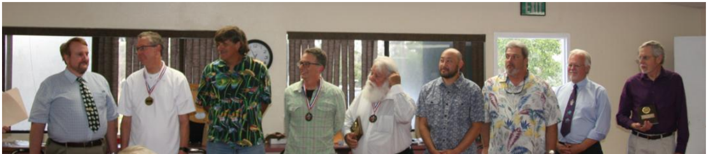
Incoming Board of Officers (2019-20)

Randy, for the entertaining performance (which was done free-of-charge as a favor to the Ring)!