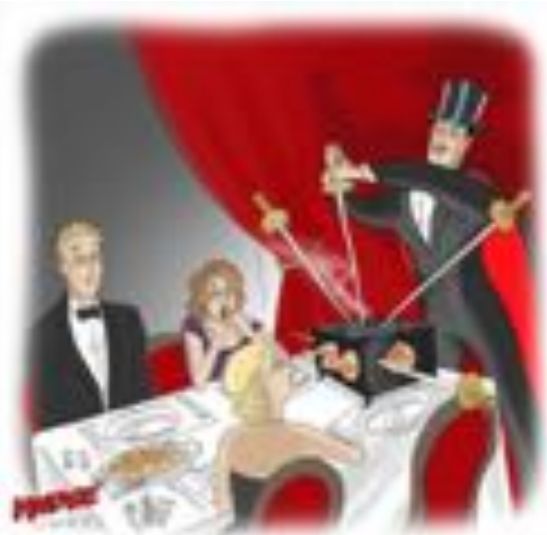
Mandrake curves the turkey.

In the meantime, have a Happy Thanksgiving to you and all your families.