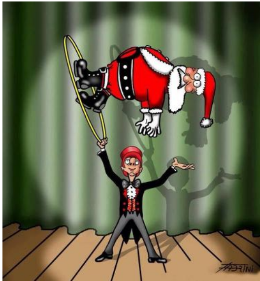
Happy Holidays from your Ring 76 Library!

If you have watched a magic video or read a magic book (good or bad), please drop me an email telling me what you thought of it so I can include your comments in the next issue of Ex Libris.