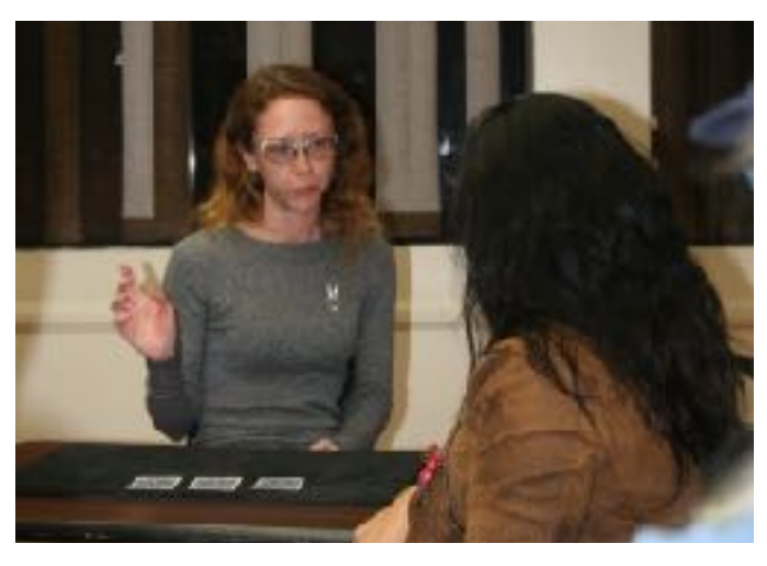
San Diego Ring 76 International Brotherhood of Magicians