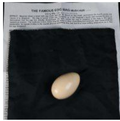
Malini Egg Bag