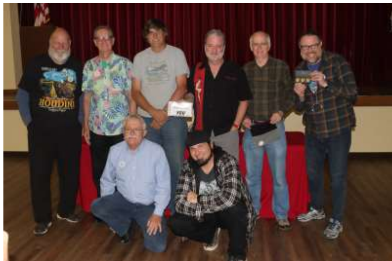
Presenters at the April 2022 Ring 76 Meeting

Of course, patter helps make a trick fun. I ramble on about there being a genie in every glass bottle. This explains why so many drinks now come in cans or plastic bottles – it's not a glass shortage, it's a Genie shortage! Anyway, if you do encounter a real glass bottle, there's usually a playful Genie inside.