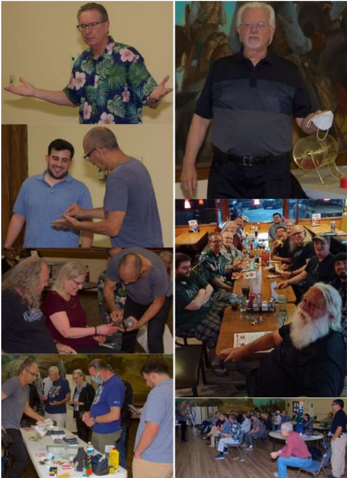
San Diego Ring 76, International Brotherhood of Magicians