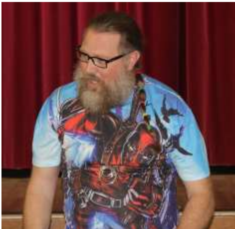
“Mr, Funtastic” Unmasked