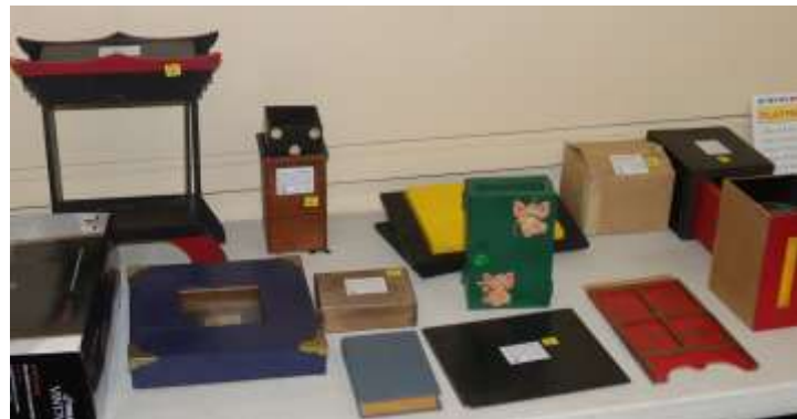
Classic Treasures from the collection of "Honest Sid" Gerhart offered for sale at this year's Swap Meet.