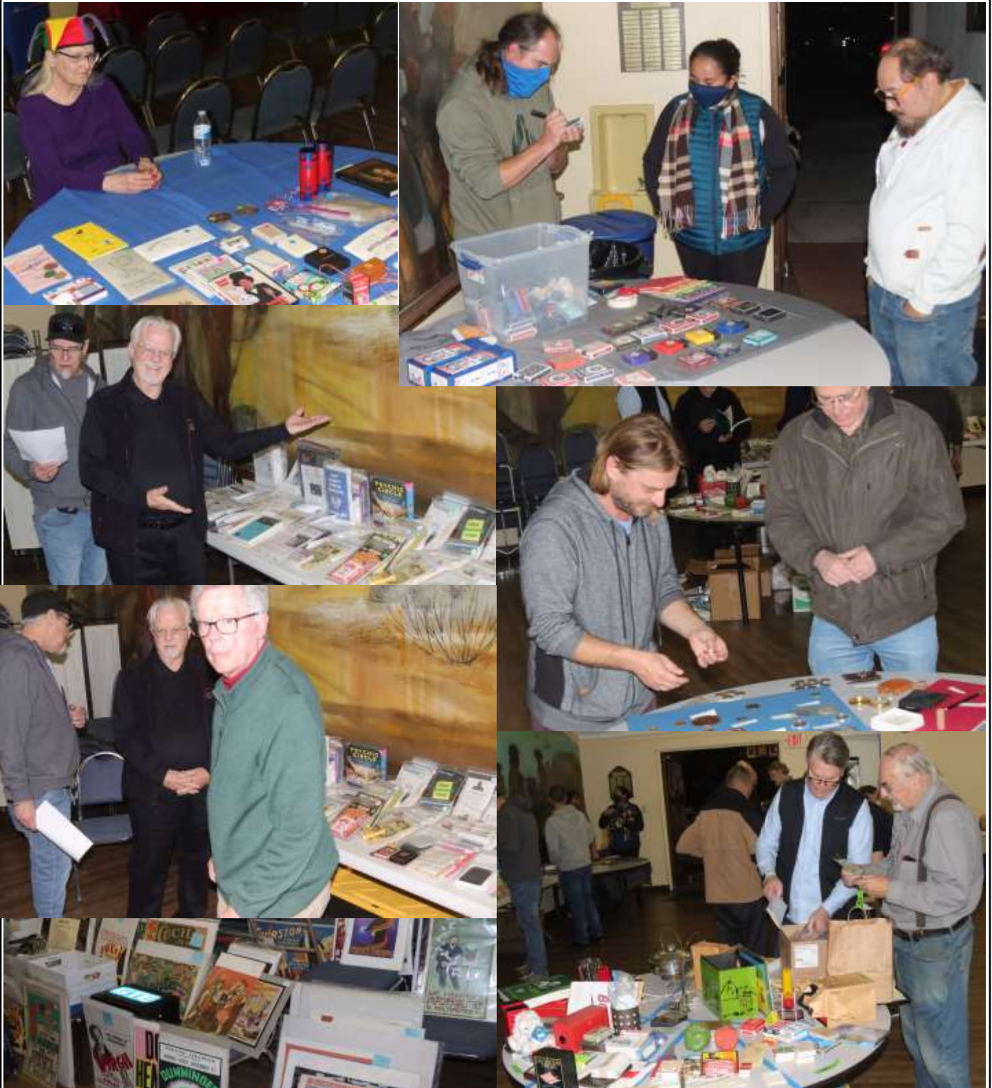
San Diego Ring 76, International Brotherhood of Magicians