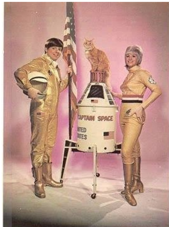
CAPTAIN SPACE and SOLAR SUE “Magical Variety Show”