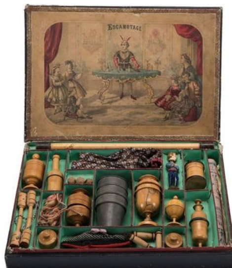
Escamotage Magic Set. Paris, ca. 1880.