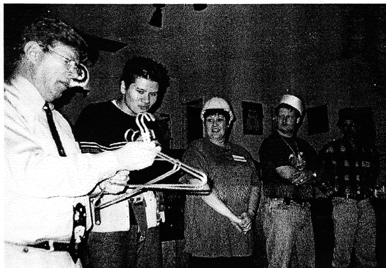
Was this the American Legion Hall or the YMCA?