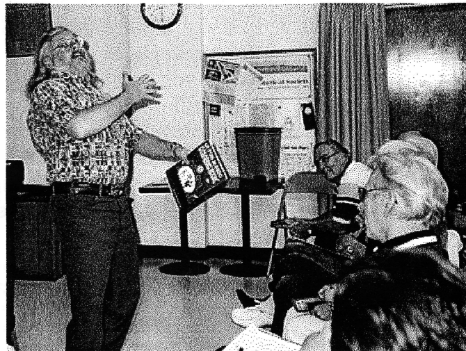
Loch David Copperfield and the Magic Coloring Book.