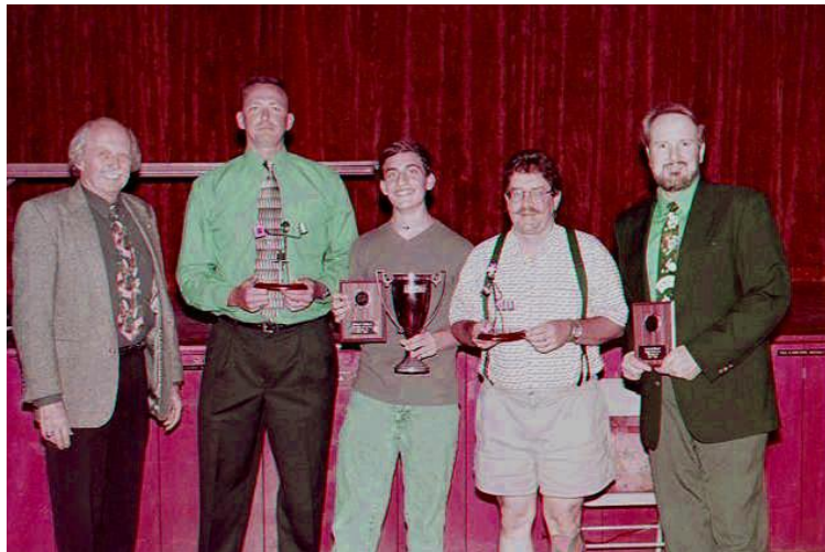
The winners of this Competitions