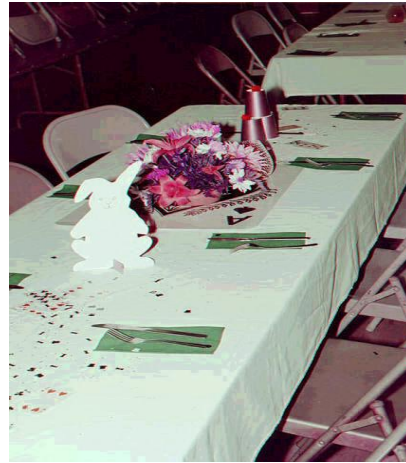
Ring 76 says good-bye to outgoing board members board members