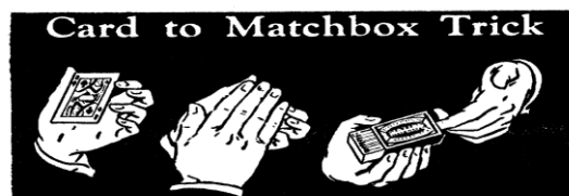
Mystify Your Friends With This Trick.