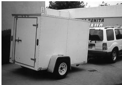
(above: This is a heavy show for a school unit and as such travels in this cargo trailer that is parked just outside of the school auditorium stage door.)