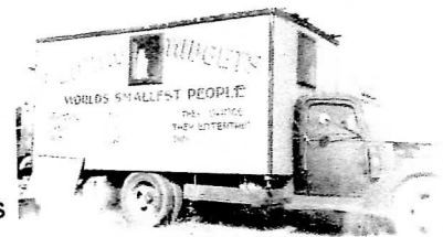
Filipino magic act on Cole Bros., Circus 1946

The picture was taken in 1946, on the old Cole Bros. Circus; the truck in the photograph was the home and transportation for a family of Filipino midgets who appeared on the Cole Bros.