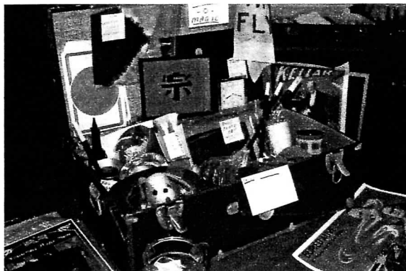
Above one of the prize auction items that went for $45 a foot locker filled with magic props and silks. This was a highlight of the auction.

Many individual members brought some very nice props and effects that they no longer used. One seller told MagiCurrents that they made a lot more