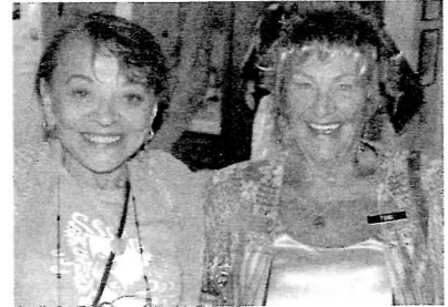
The "It" Girls