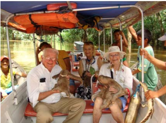
Manaus, Brazil April 15, 2008