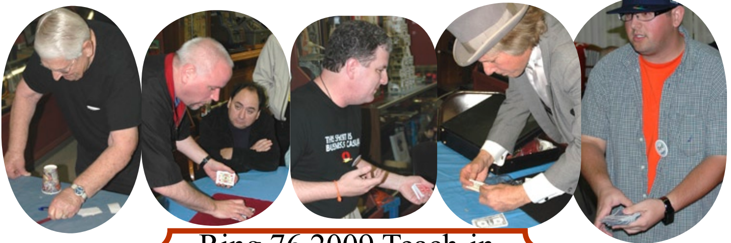
Ring 76 2009 Teach-in

This year's teach-in was well appreciated by all who attended and it encouraged a few guests to join on the spot!