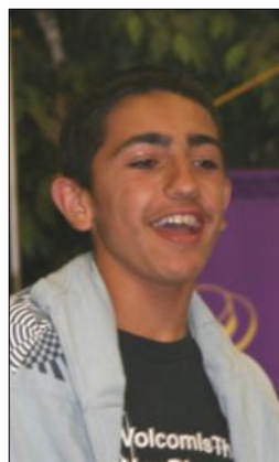
5. He reveals the chosen card. Success!