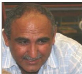
3. Dad watches from the sidelines, hoping for the best.