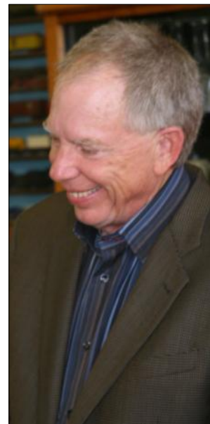
6. The Veteran takes notice.