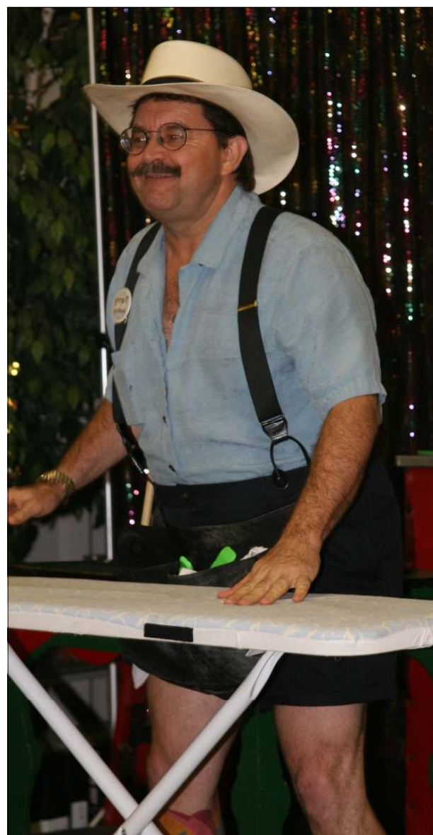
Godfrey The Magician

Laughter was flowing at the September meeting!