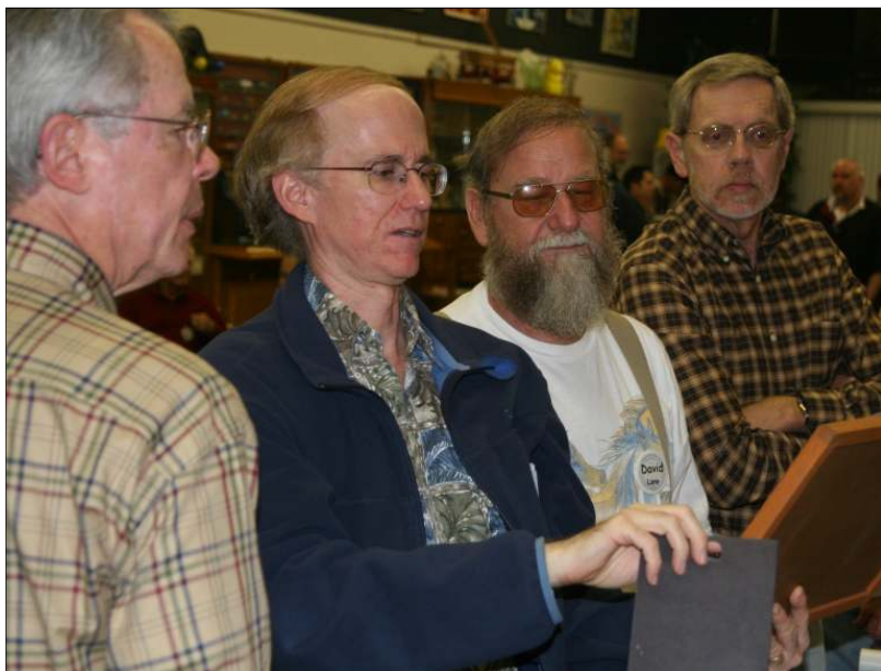
Three dozen members signed up to buy and sell.