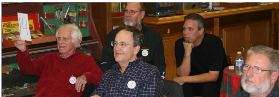
Some incredible bargains were found that night!