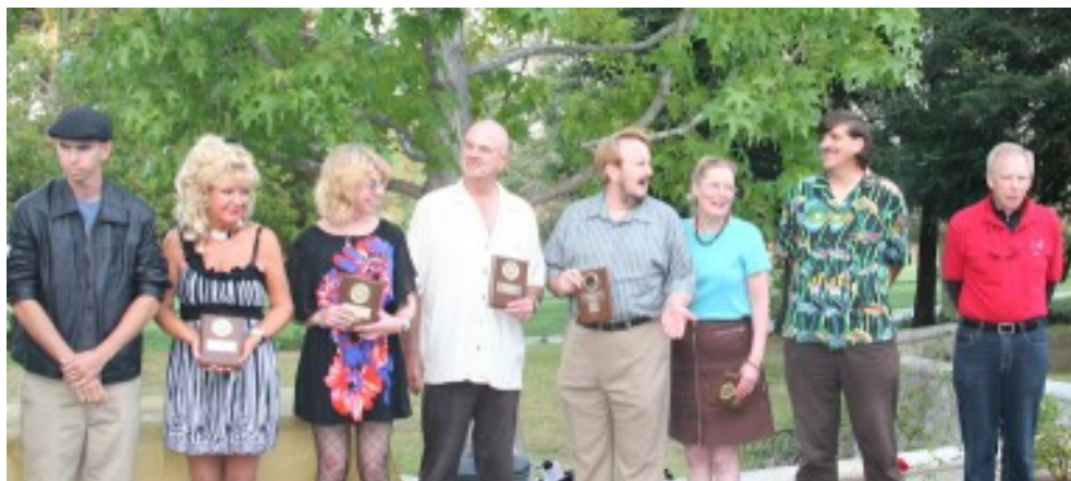
Officers of the 2010-11 Ring 76 Board are sworn in.