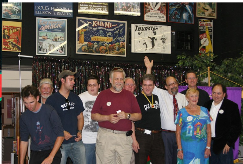
An August Group of Performers