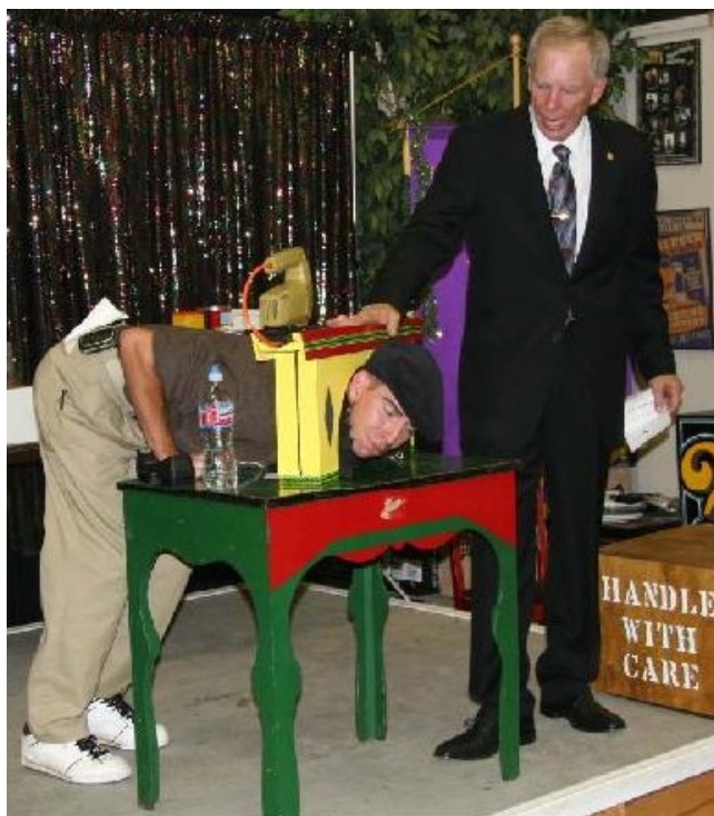
Skill-saw illusion up for bid. (Kenny not included)

PUBLISHED BY THE INTERNATIONAL BROTHERHOOD OF MAGICIANS