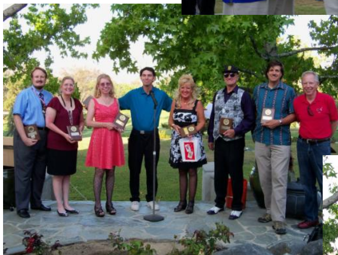
The Outgoing Gang of Rascals, er, uh Board