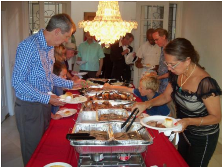
There was Food...