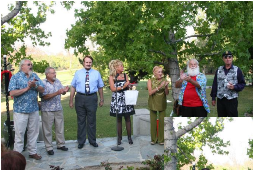
Magicians from the Stage Contest