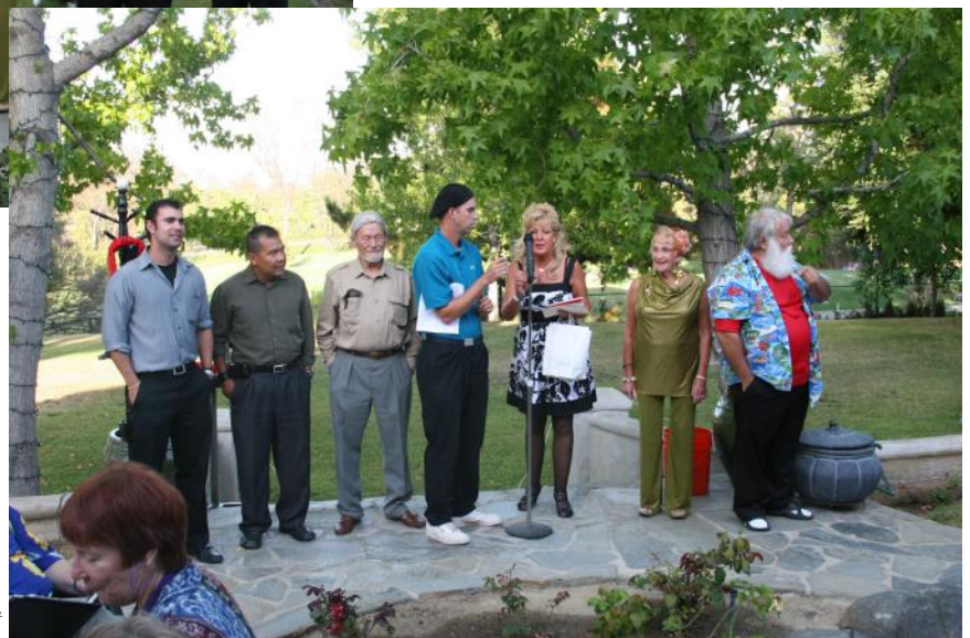
Magicians from the Close-up Contest