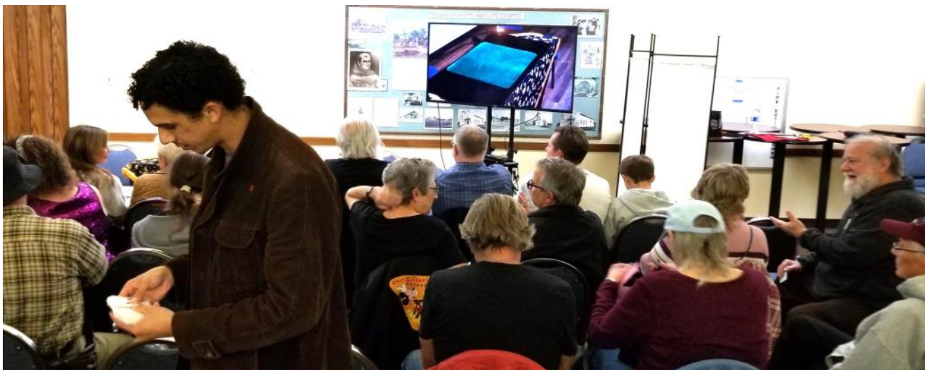
New Camera Setup used to aid in Close-up Contest viewing pleasure