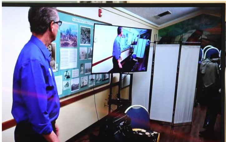
New Screen offers close up view of Close-Up Competition